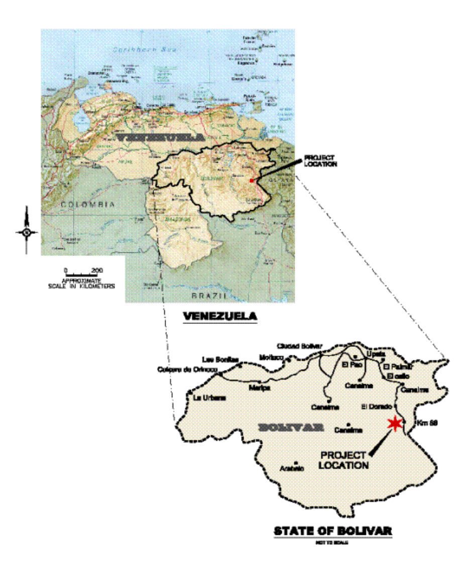
Exhibit 99.3 Management's Discussion & Analysis - Page 6

The Brisas Cristinas Project is located in the Guyana region, in the Kilometer (Km) 88 gold mining district of Bolivar State in southeast Venezuela. The name Kilometer 88 for the district came from the area being located near kilometer 88 marker of the road linking El Dorado (Km 0) with the Brazilian border (Pan American Highway or Highway 10). Las Claritas is the closest town to the property. The closest nearby large city is Puerto Ordaz situated on the Orinoco River near its confluence with the Caroní River. Puerto Ordaz is home to most of the major industrial facilities like the aluminum smelters and port facilities accessible to ocean-going vessels from the Atlantic Ocean via the Orinoco River, a distance of about 200 kilometers.